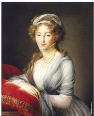
Empress Elisabeth Alexeievna of Russia by Louise Elisabeth Vigée Le Brun